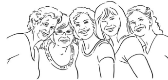
Women in Christian Fellowship

The Youth sponsored Christmas Card Mailbox for you to “mail” your Christmas cards to church members “in house” begins Sunday, December 6 . You may bring your Christmas cards to the vestibule for distribution to members. We’ll make sure our Homebound receive their cards as well.