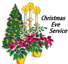
Christmas Eve Service

Our Christmas Eve Service with Holy Communion will be Friday, December 24 , at 5:00 P.M. Join us for this service as we light the Christ candle and celebrate the birth of our Savior, Jesus Christ. This service will be available virtually on Facebook.