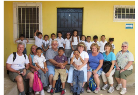
Team with Church Weekday Preschool