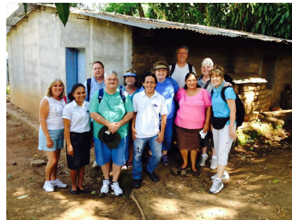
La Gloria Church